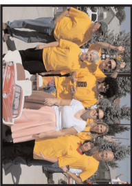
Team Valley Bank & Trust Co. proudly show off the United Way Cup and their winning office chair.

The 2008 United Way of Western Nebraska Campaign kicked off in typical United Way fashion with more than 100 volunteers spending an entire day cleaning, repairing and painting on nearly 10 homes in the community for the annual Day of Caring. Volunteers from area businesses and Western Nebraska Community College athletic teams worked hard in the September sun to help those in need, from elderly to developmentally and physically challenged people. A wide variety of supplies were donated for the projects by Diamond Vogel