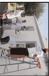
Members of the WNCSS basketball team work on a home for the Day of Caring.