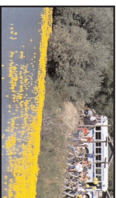
More than 500 people lined the North Platte River to watch nearly 75,821 ducks race to the finish line. See official Duck Dash results on inset.